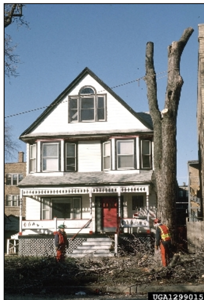
Street Tree Removal in Chicago