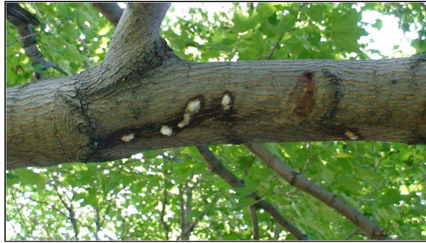
Sap Frothing from Oviposition Sites

When freshly made, the pit often stands out due to the contrast between the outer and inner bark. As the wound oxidizes and then as the tree responds, there is a marked loss in this color contrast.