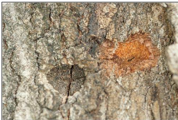
Old and New ALB Oviposition Sites

Exit holes: ALB exit holes are circular and large – on the order of \frac{1}{4} to \frac{1}{2} inch in diameter. Exit holes may be anywhere on the tree. It is good to inspect branches that have been pruned or fallen from the tops of trees, as that is where infestations usually begin. There are also exit hole “look-alikes”, including the exit holes of the leopard moth and the feeding marks of sapsuckers.