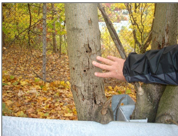
ALB Exit Holes

The best indication of the presence of an ALB infestation is the insect itself. While the insect is large and striking in appearance, it also can be very hard to spot. Other good indicators that point to the presence of the ALB are: