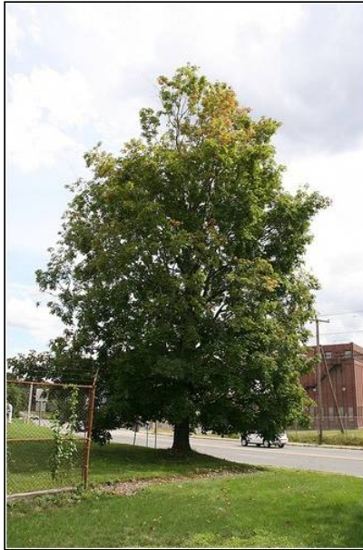
Worcester Tree, Heavily Infested Likely One of the First Trees Infested Peter Trenchard, CAES

same trees. As this feeding pattern is not commonly observed with other insects, it can be considered a good indicator of the presence of the ALB.