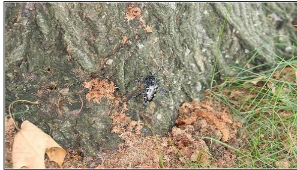
Frass at Base of Maple (with ALB)

Frothing sap: After the adult female has chewed an oviposition pit, the tree may begin bleeding sap. In turn, this sap often begins to ferment, becoming frothy or foamy and attracting other insect that feed on the sap.