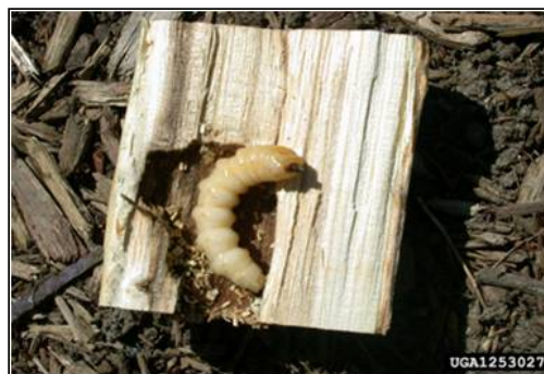
Larval Asian Longhorned Beetle