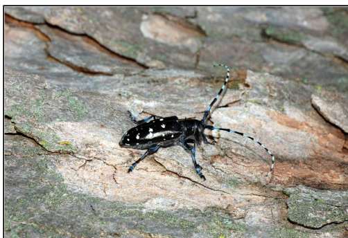
Adult Asian Longhorned Beetle