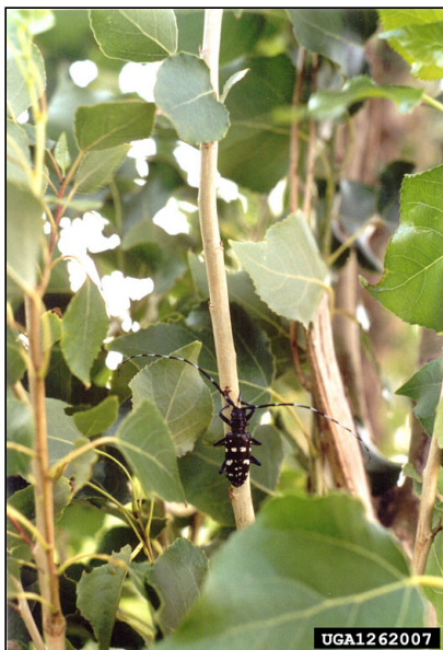
ALB Male on Poplar in China