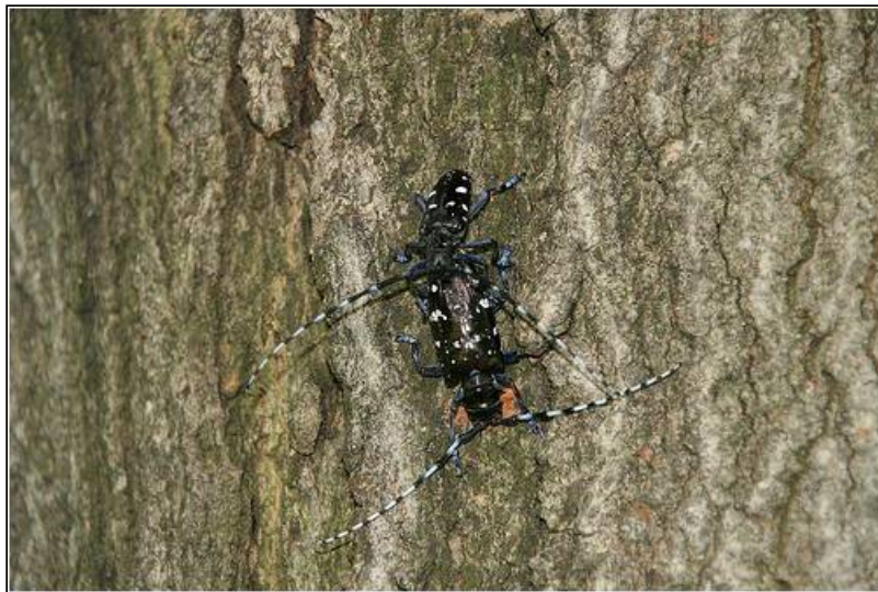
Mate Guarding (male guards female as she chews oviposition pit)

Not much is known about possible causes of mortality for the beetles, other than the cold weather of late fall. Specific predators, parasites or diseases that would reduce beetle numbers have not been recorded.