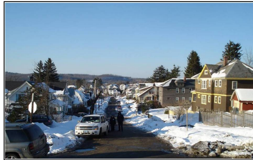
Worcester Street After Tree Removals from ALB

Arguably, nowhere else in the United States do so many people in one state live in such close proximity to so many trees. The lives of the people of Connecticut are closely interwoven with the trees that grow in our forests, in our yards and neighborhoods, along our streets and our highways, and in our parks and playgrounds. It is estimated that Connecticut is about 60% forested. That percentage does not include those trees that are outside our forests but are in our towns and cities and still very much a part of our daily lives.