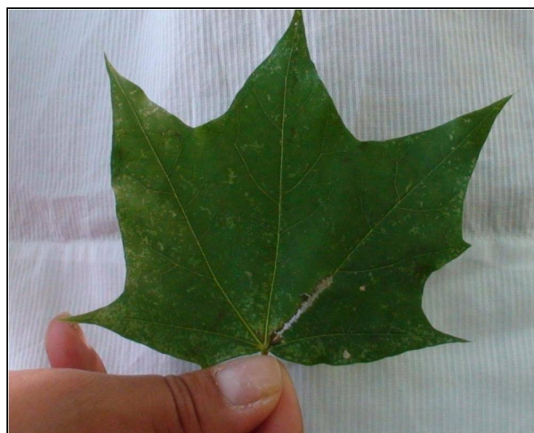
Midrib Feeding from Adult ALB

Frass: As the larva feeds, the solid fecal matter it generates is mixed with the wood shavings that also result from its feeding. This mixture is known as frass. As the larva feeds, it pushes frass back out of its tunnel, where it may be seen protruding from cracks in the bark of the tree or on the ground or caught in the crotches of infested trees. The frass from the ALB is relatively large and coarse as compared to that from other insects, such as carpenter ants or carpenter bees.