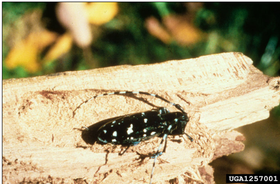
The Asian Longhorned Beetle

Note - the ALB is one of several exotic pests that may affect trees in Connecticut over the next several years. Some, such as the emerald ash borer , have the potential to be as devastating as the ALB. The point to bear in mind is that, to protect trees, people in the state need to be watchful and also to be careful. Spotting potentially harmful insects early helps limit the amount of damage that can be caused. Practices such as using only locally grown firewood reduces our vulnerability. All efforts help greatly.